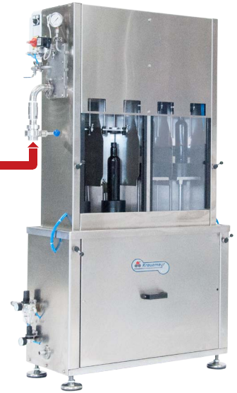
Caption: 1) Carbonator pump, 2) Pneumatically-actuated filling unit, 3) Run-dry protection, 4) Pressure regulation unit for CO 2 & connection for carbonated liquids, 5) Crown caps closing machine