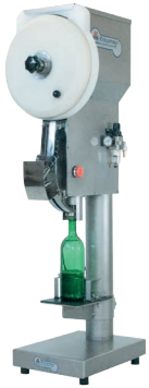
PNEUMATIC OPERATED CROWN CAPPER